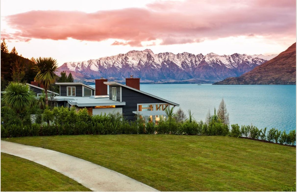
New Zealand and Fiji